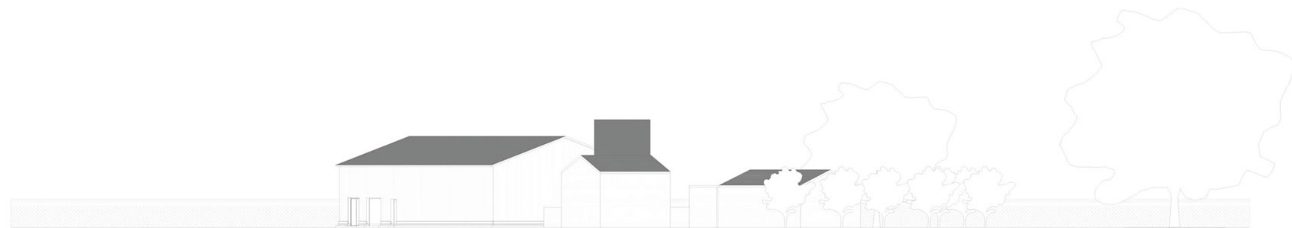
4 West Elevation 1:200