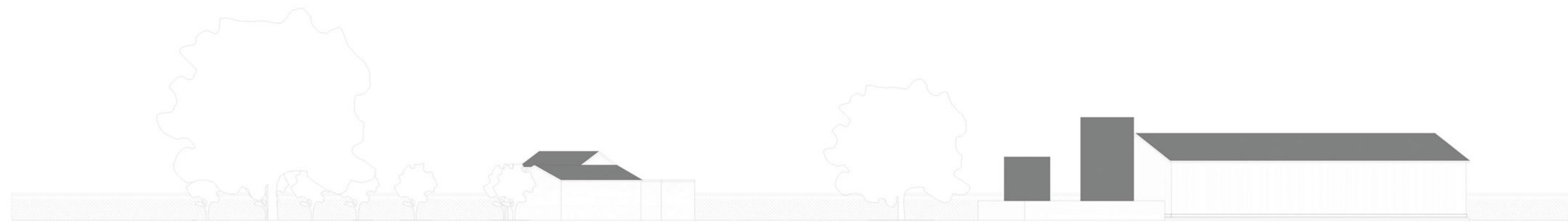
3 South Elevation 1:200