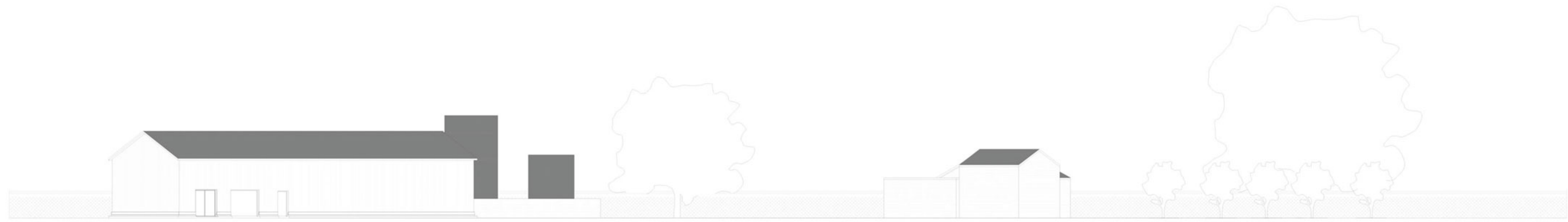
2 North Elevation 1:200